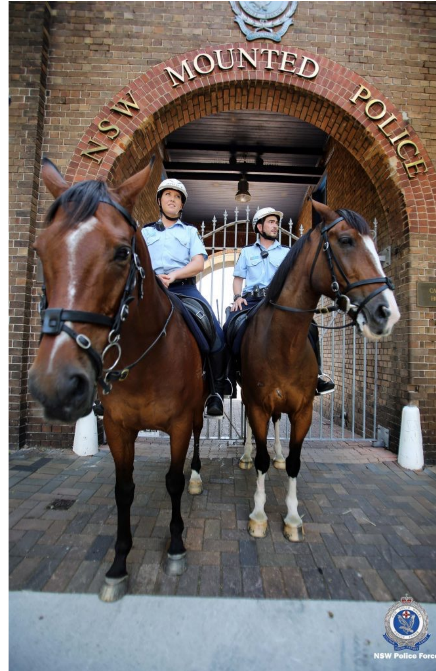
B. NSW Police Horses