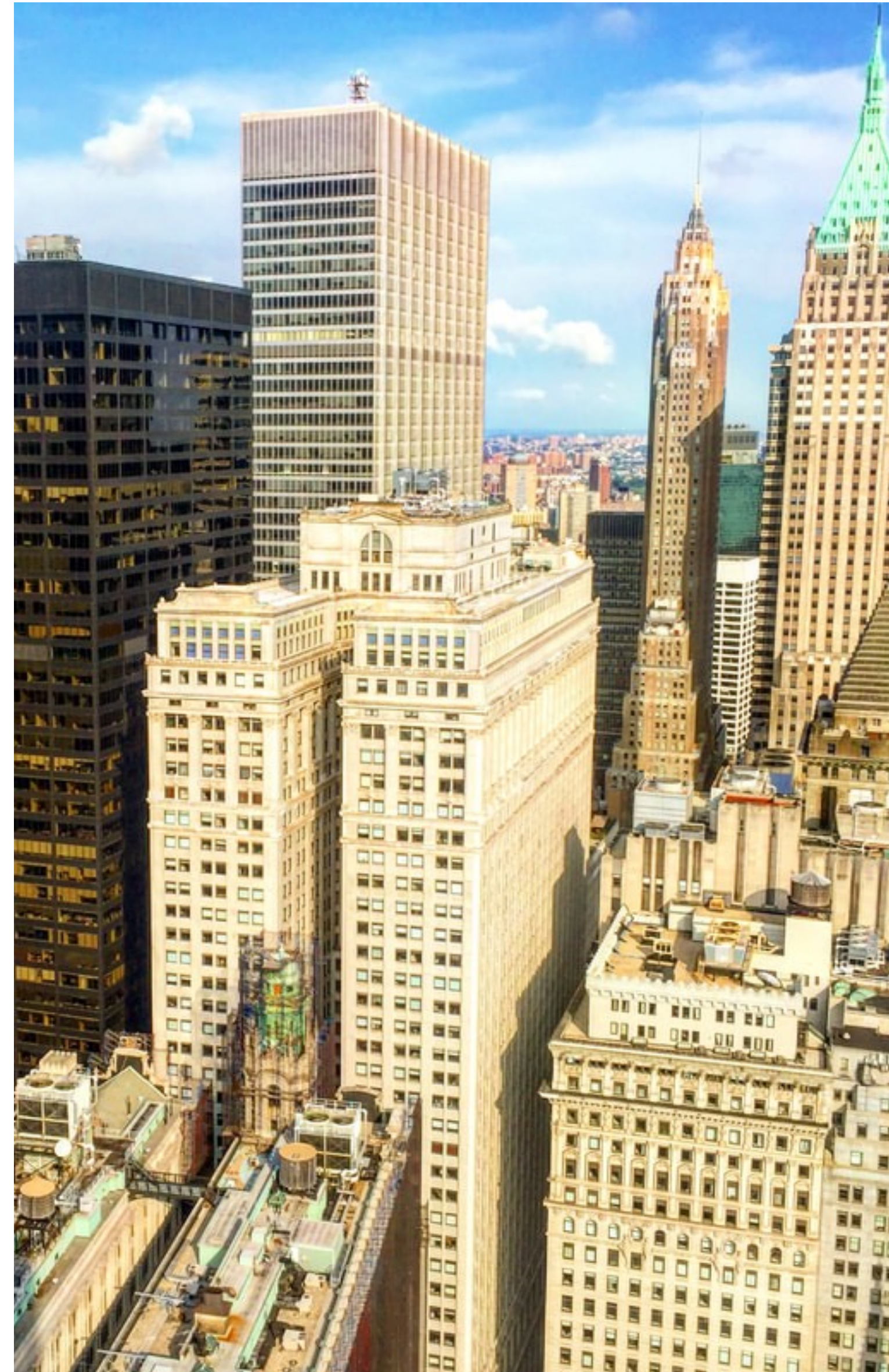
B. New York