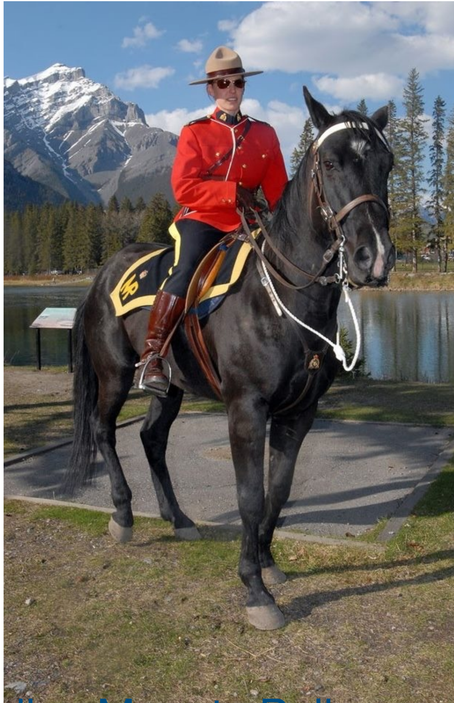
A. Canadian Mounty Police Horses