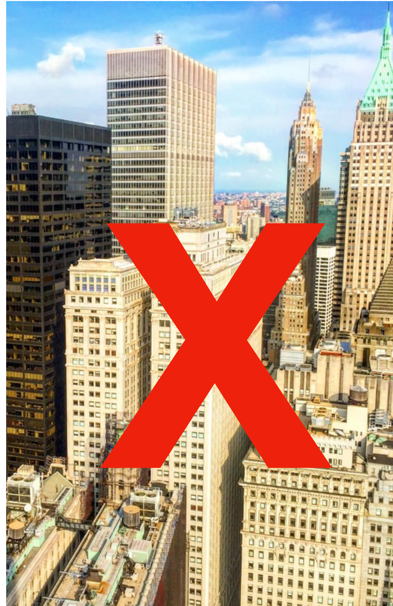
B. New York-1902