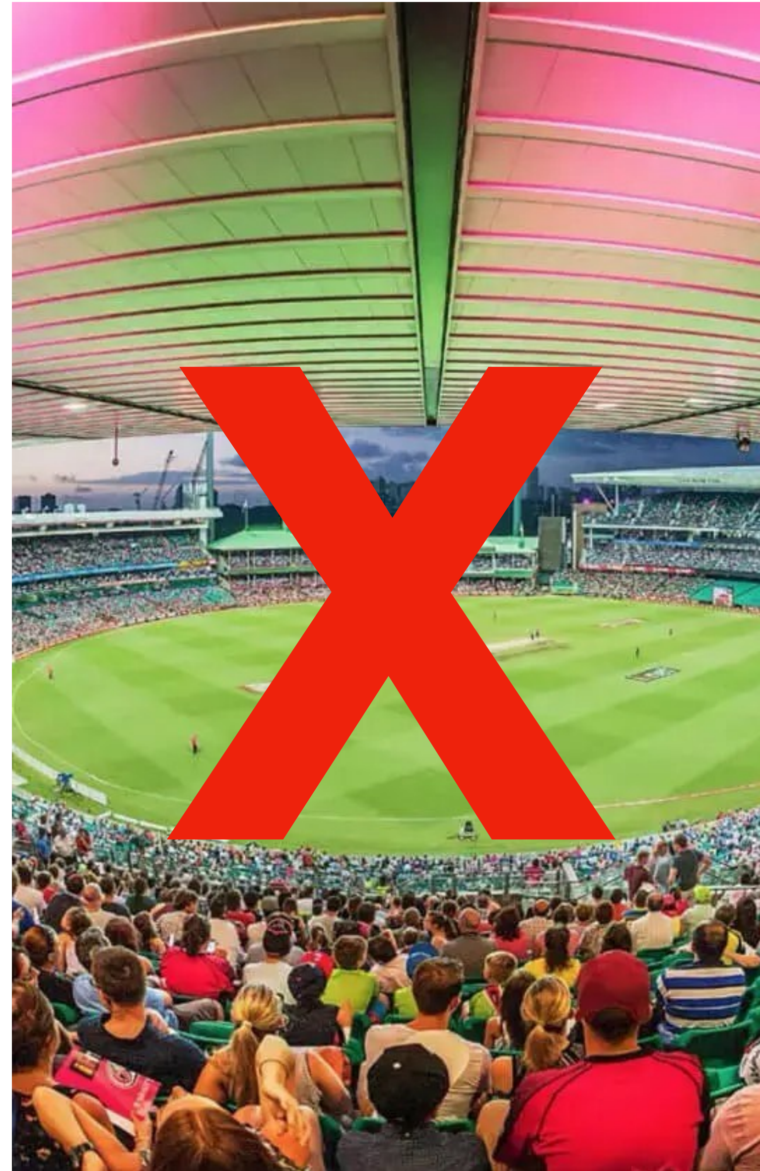
B. Sydney Cricket Ground-48,000