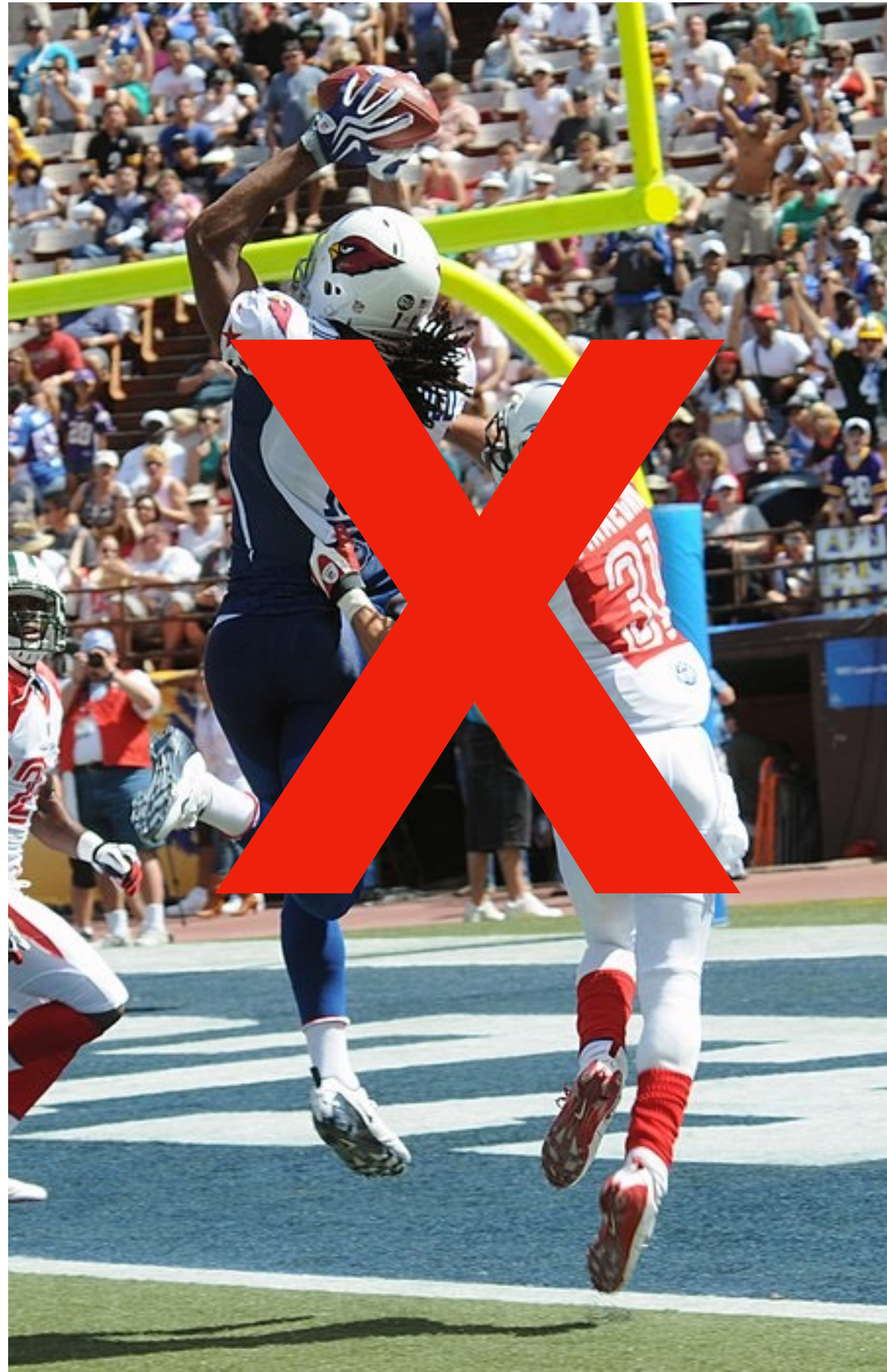
A. American Football-1869