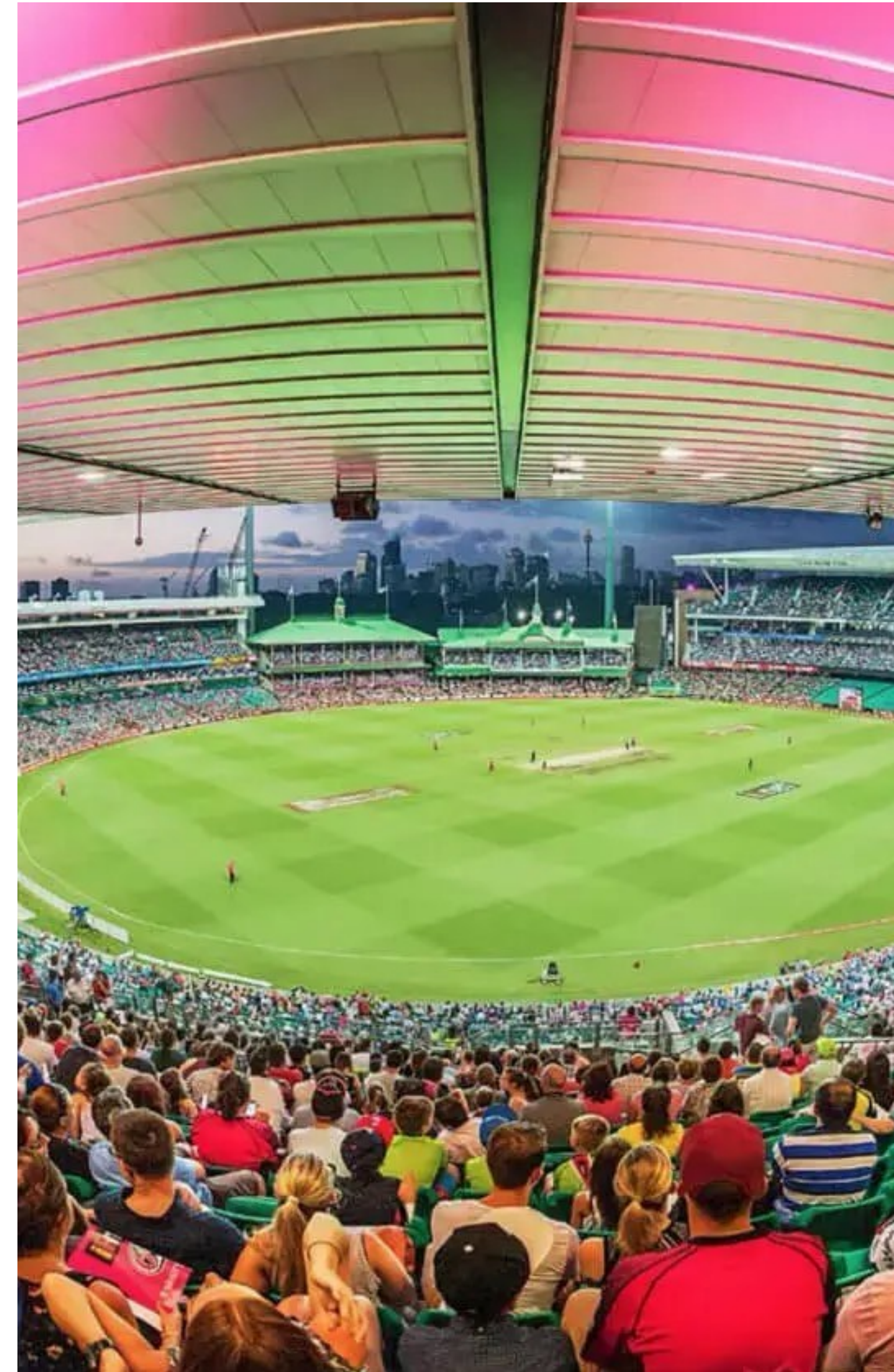
B. Sydney Cricket Ground