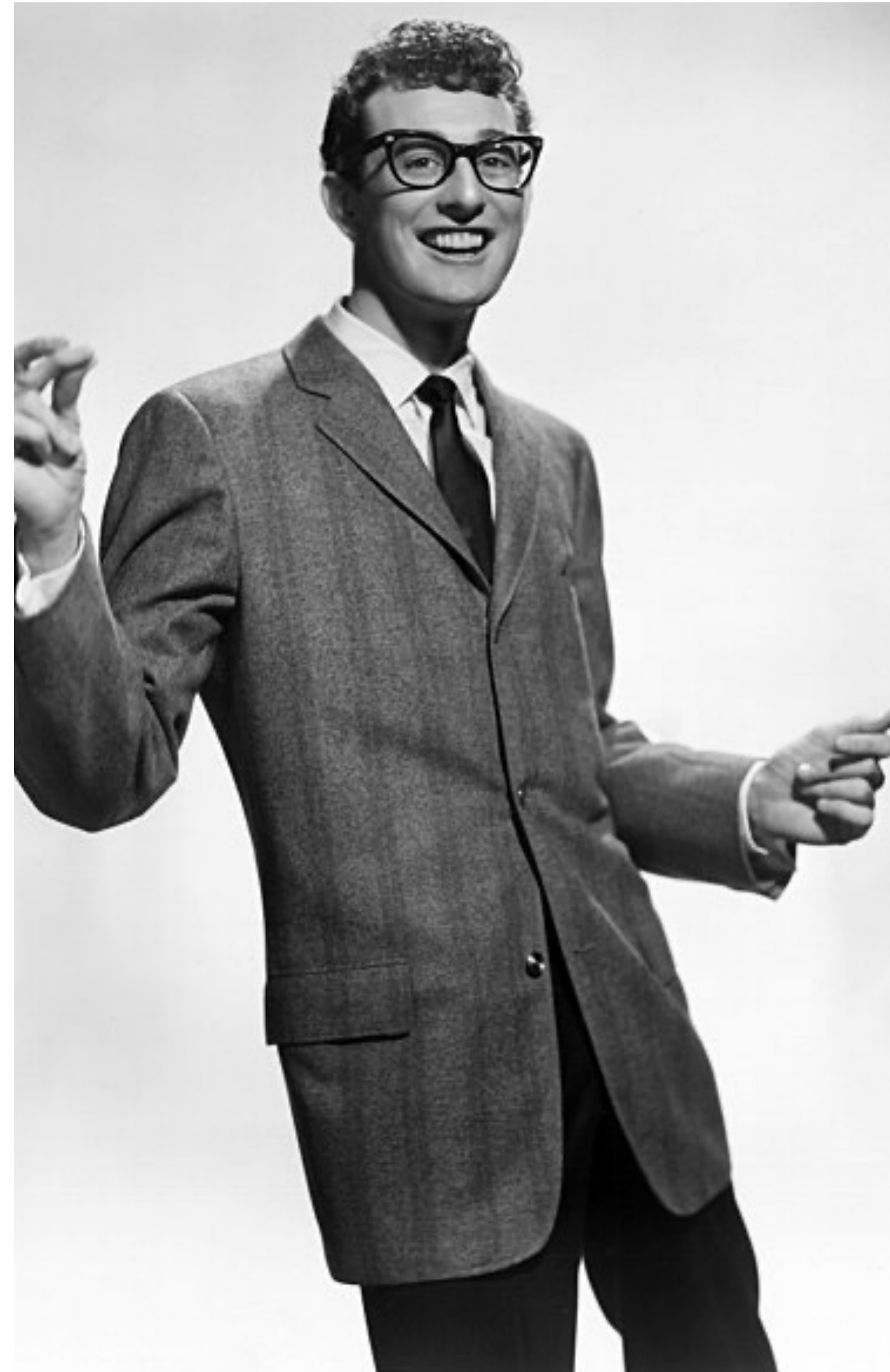
B. Buddy Holly