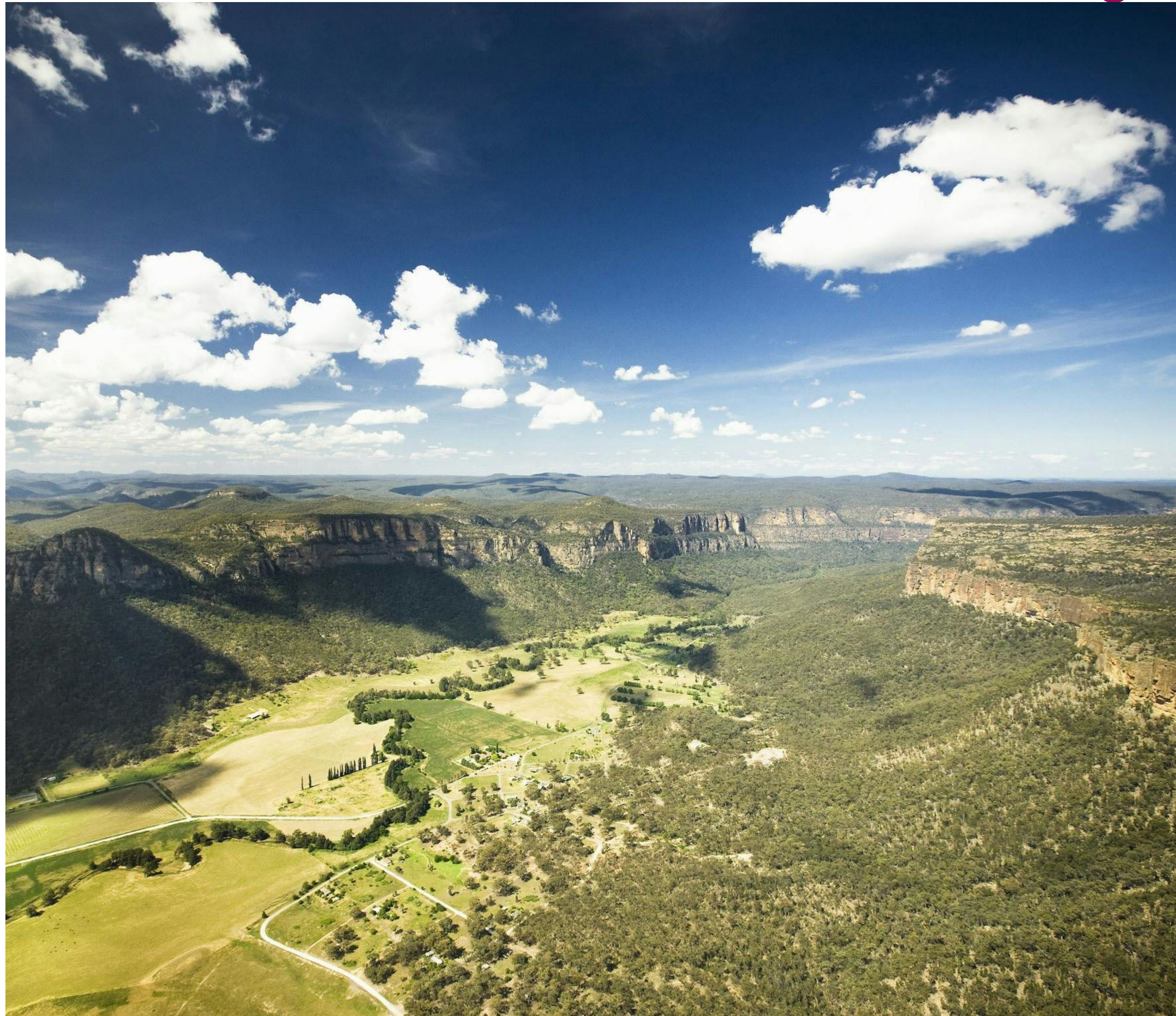
A. Capertee Valley at Lithgow

Answer 9. Which is the larger canyon by width?