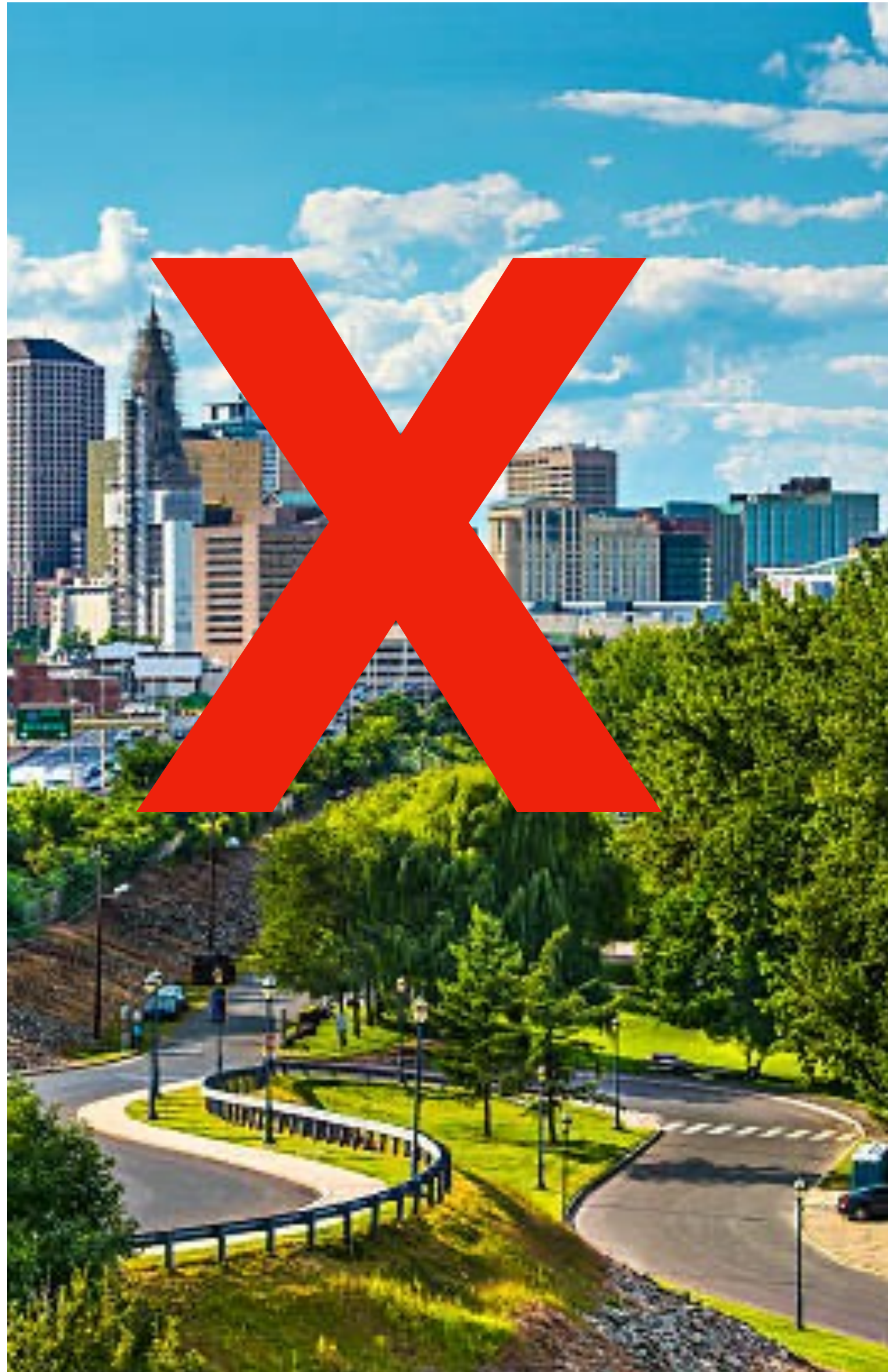
A. Connecticut USA