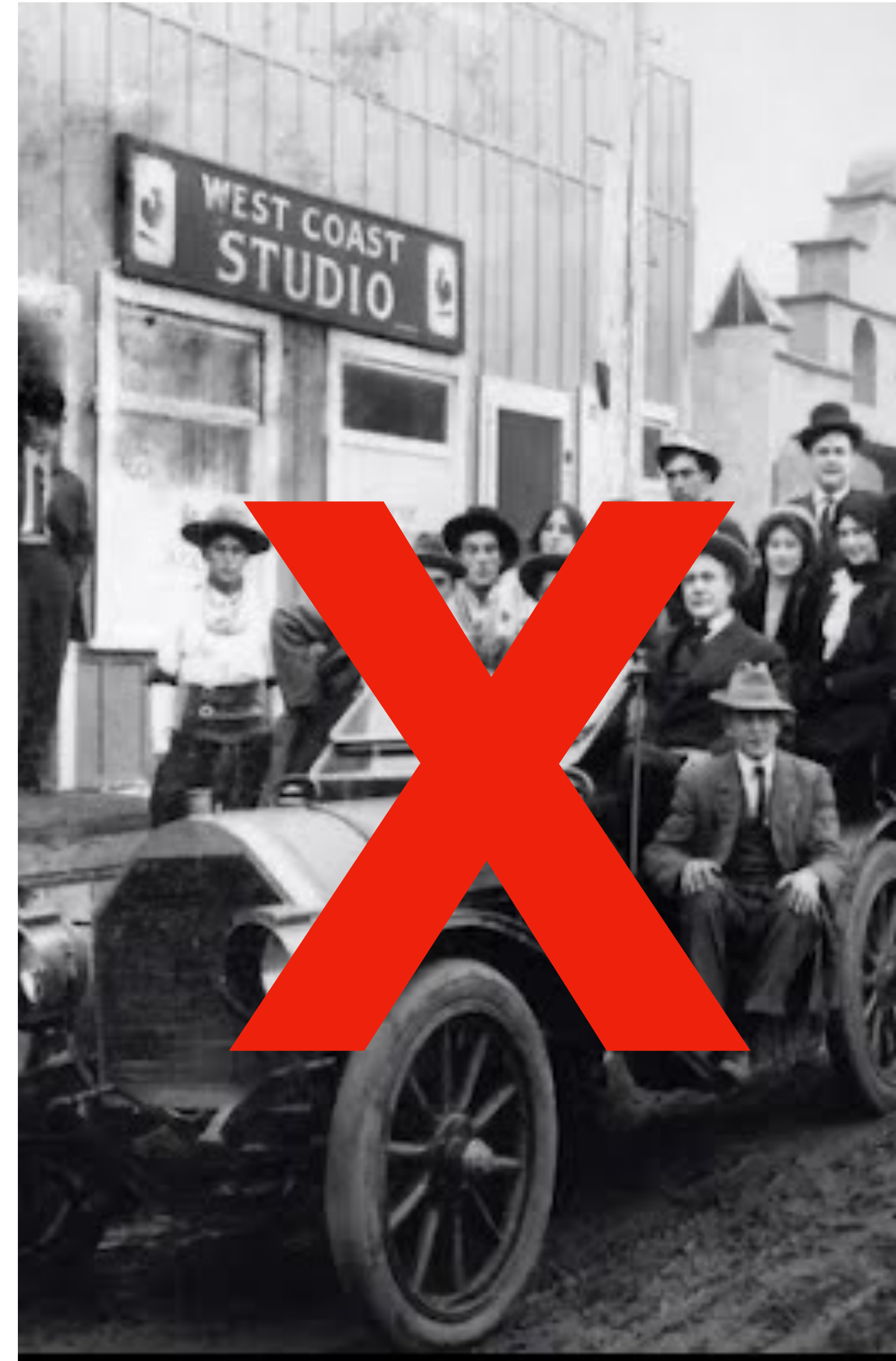
B. Los Angeles - 1909