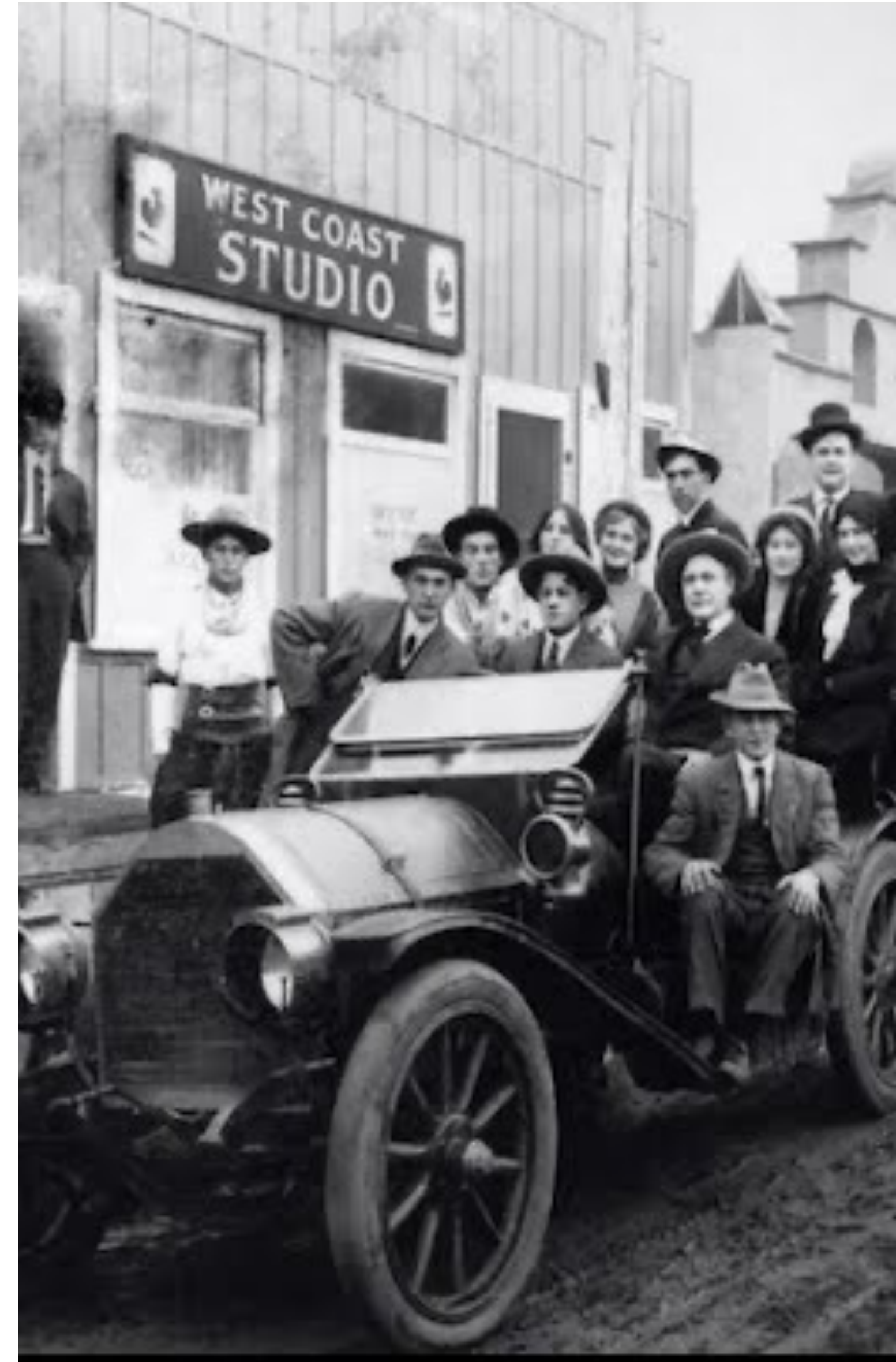
B. Los Angeles