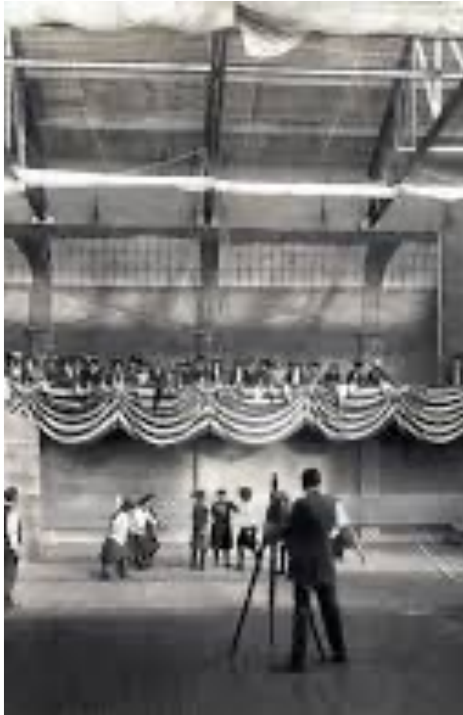
A. New York-1892

Answer 8. Which city had the first film studios?