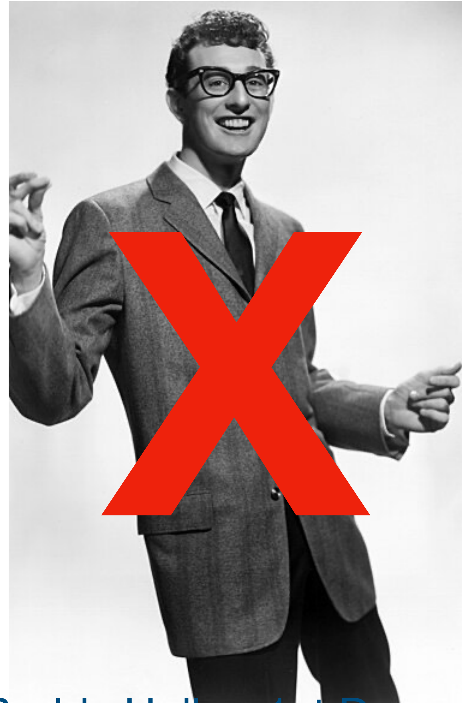
B. Buddy Holly - 1st December 1957