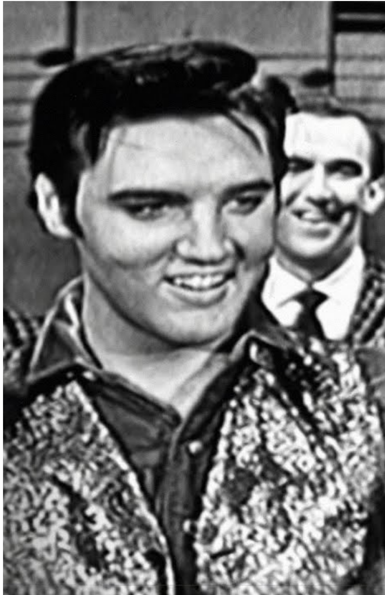
A. Elvis Presley