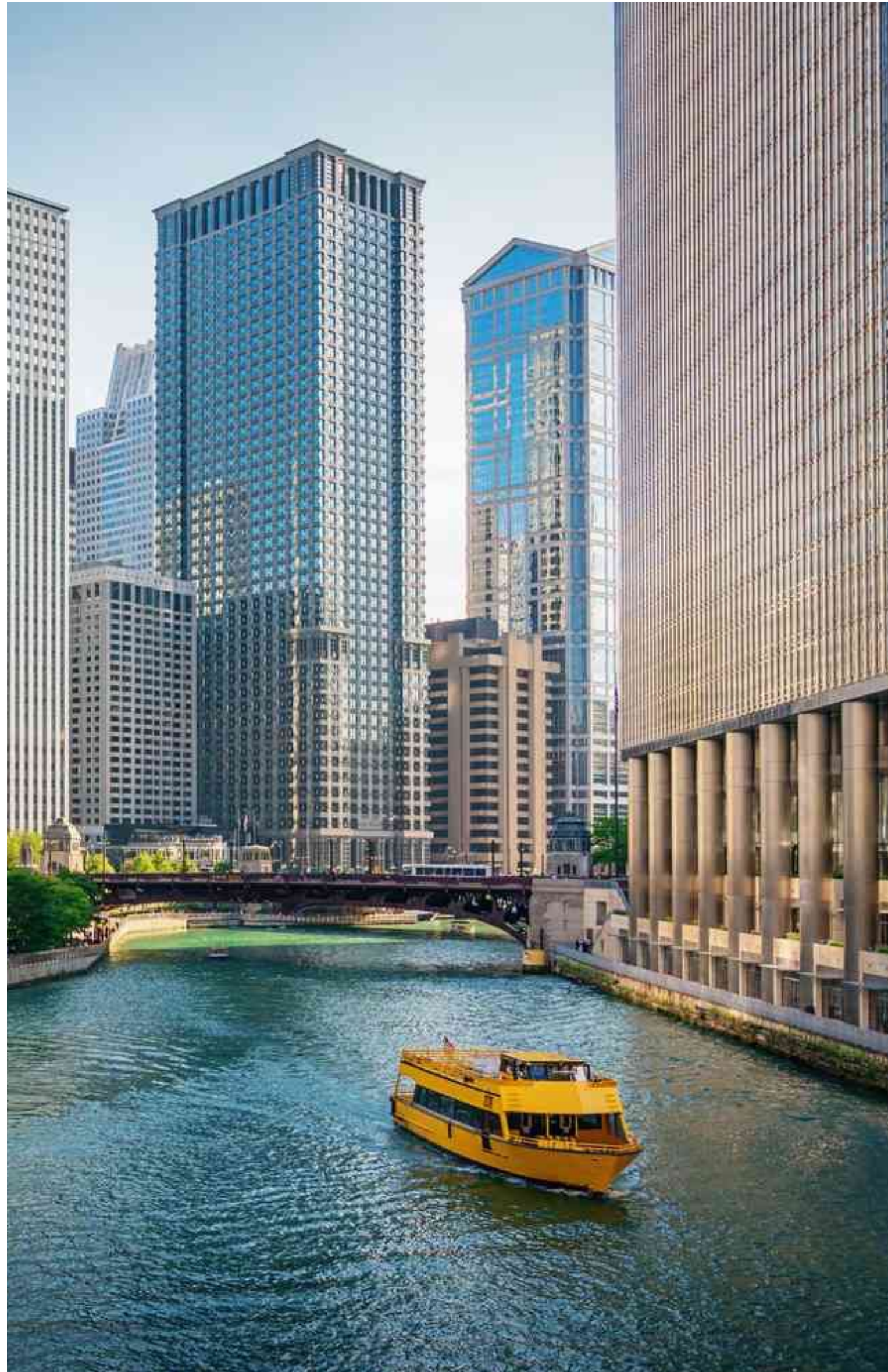
A. Chicago - 1885

Answer 7- Which city was the birthplace of skyscrapers?