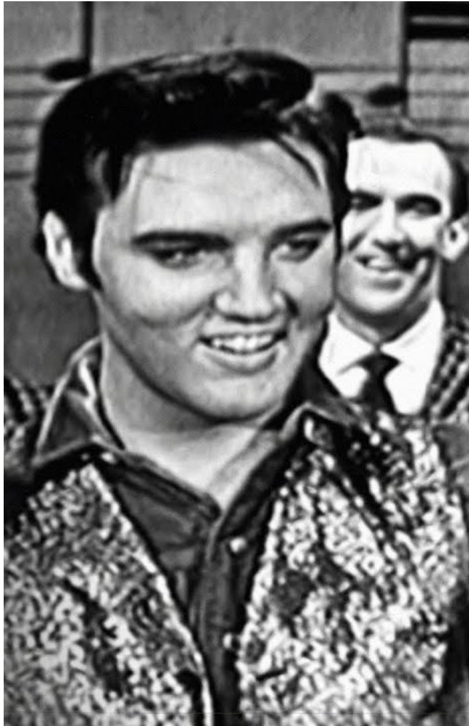
A. Elvis Presley - 28 October 1956