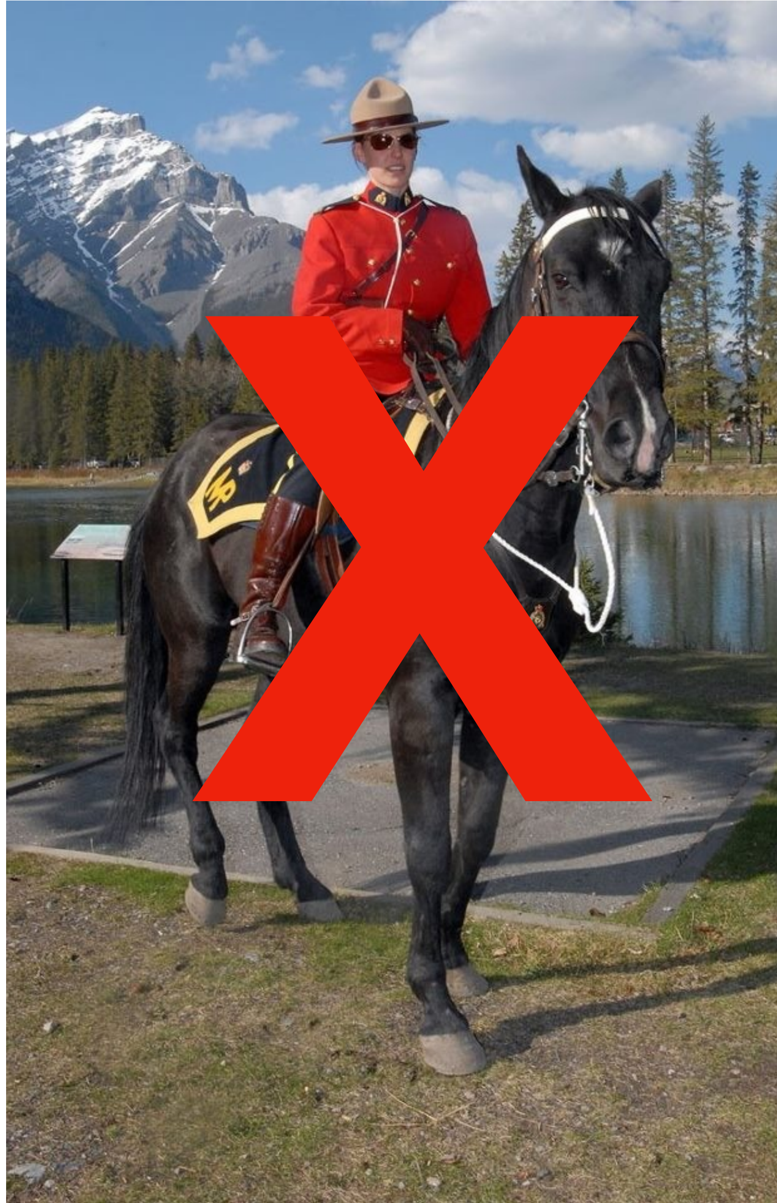
A. Canadian Mounty Police Horses – Founded May 23, 1873 6