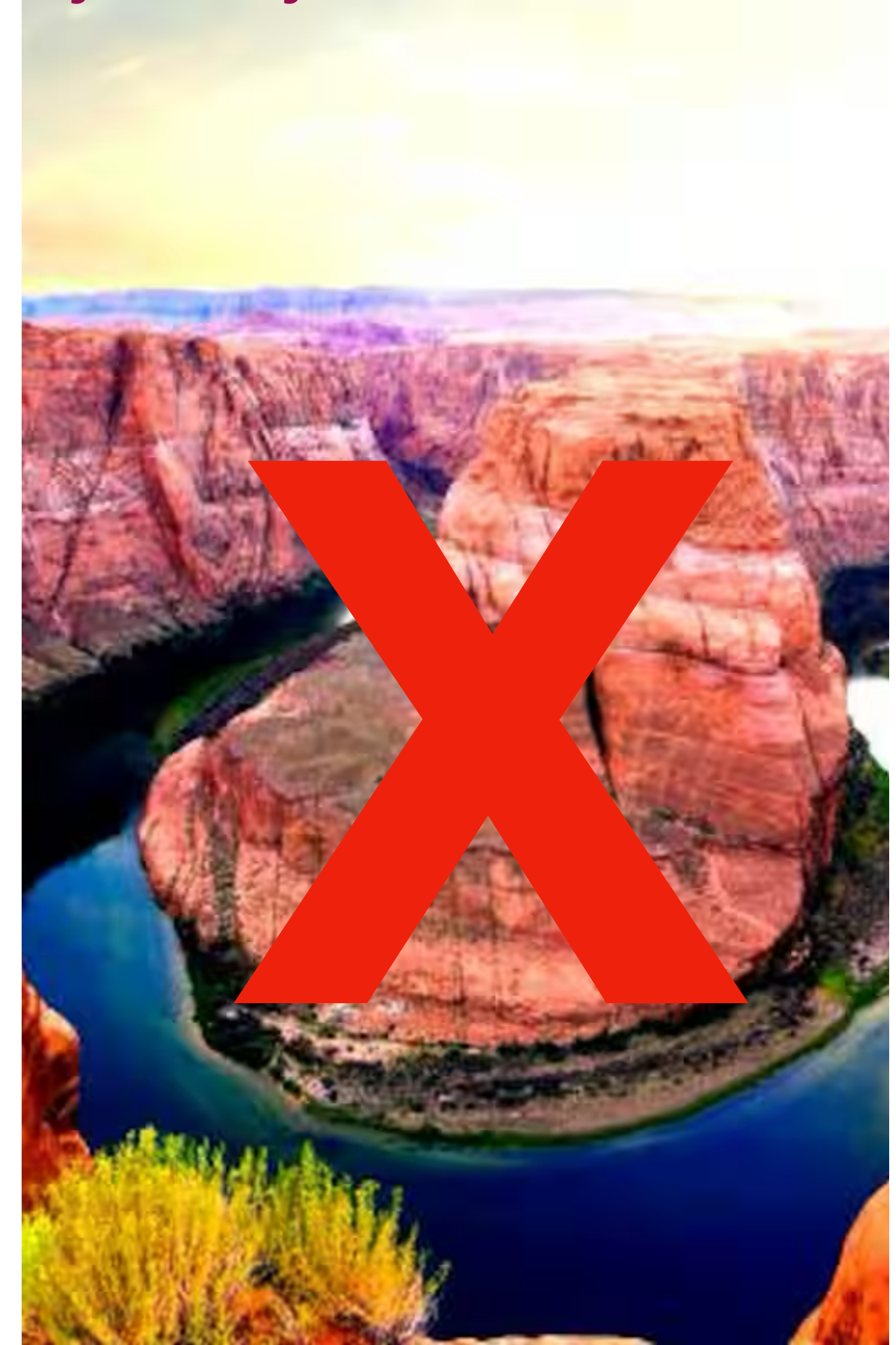
B. USA-446 kms