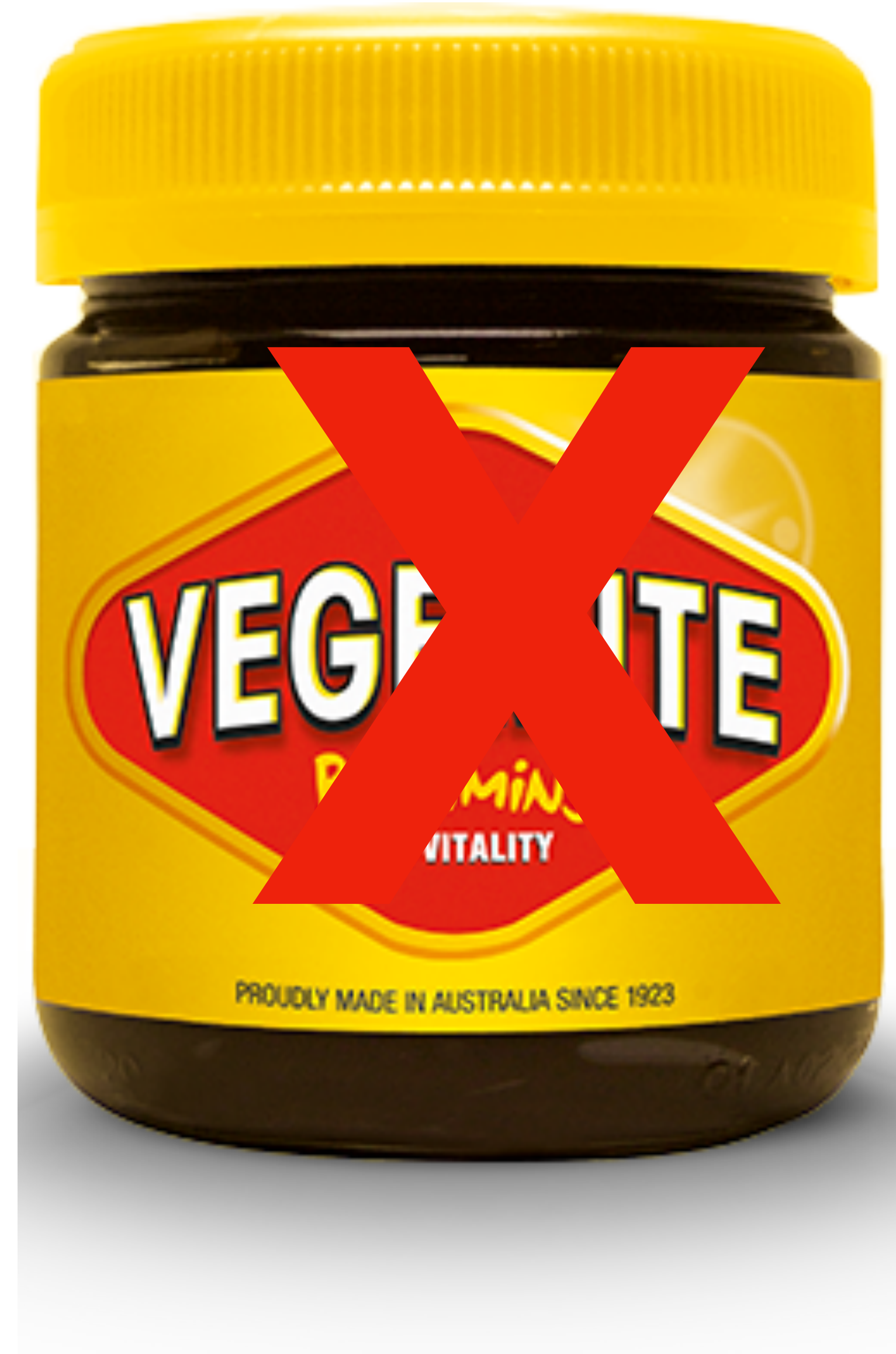
B. Vegemite - 1923