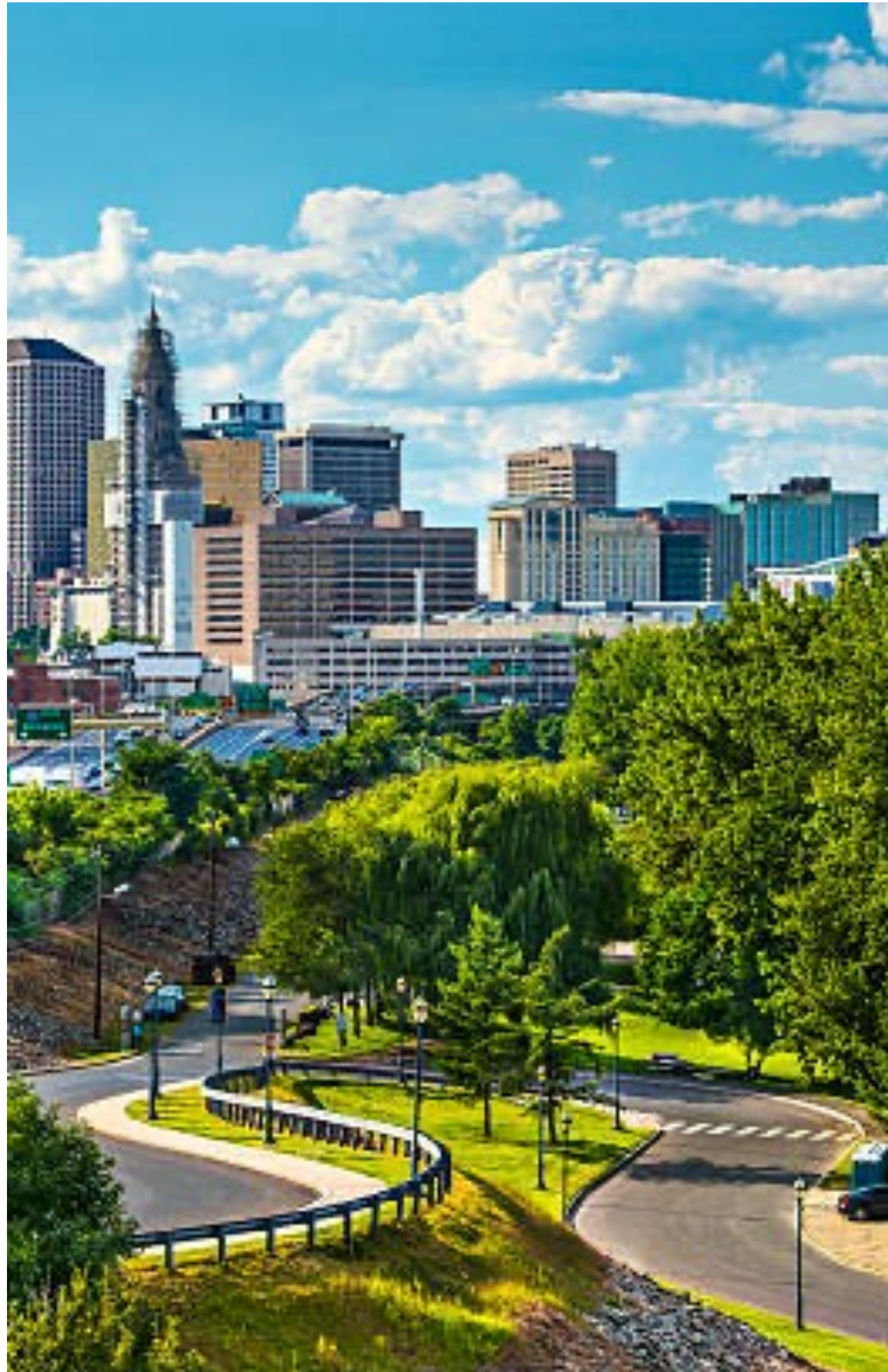
A. Connecticut USA