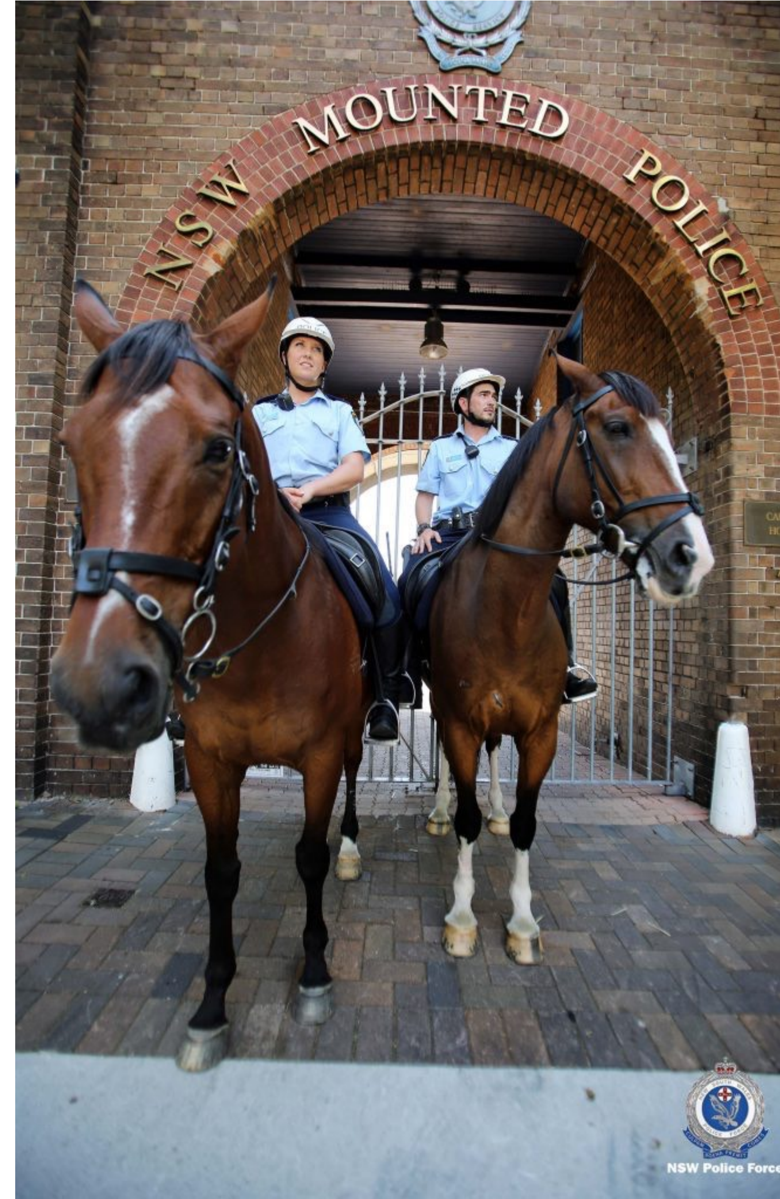
B. NSW Police Horses – Founded 7 September 1825,