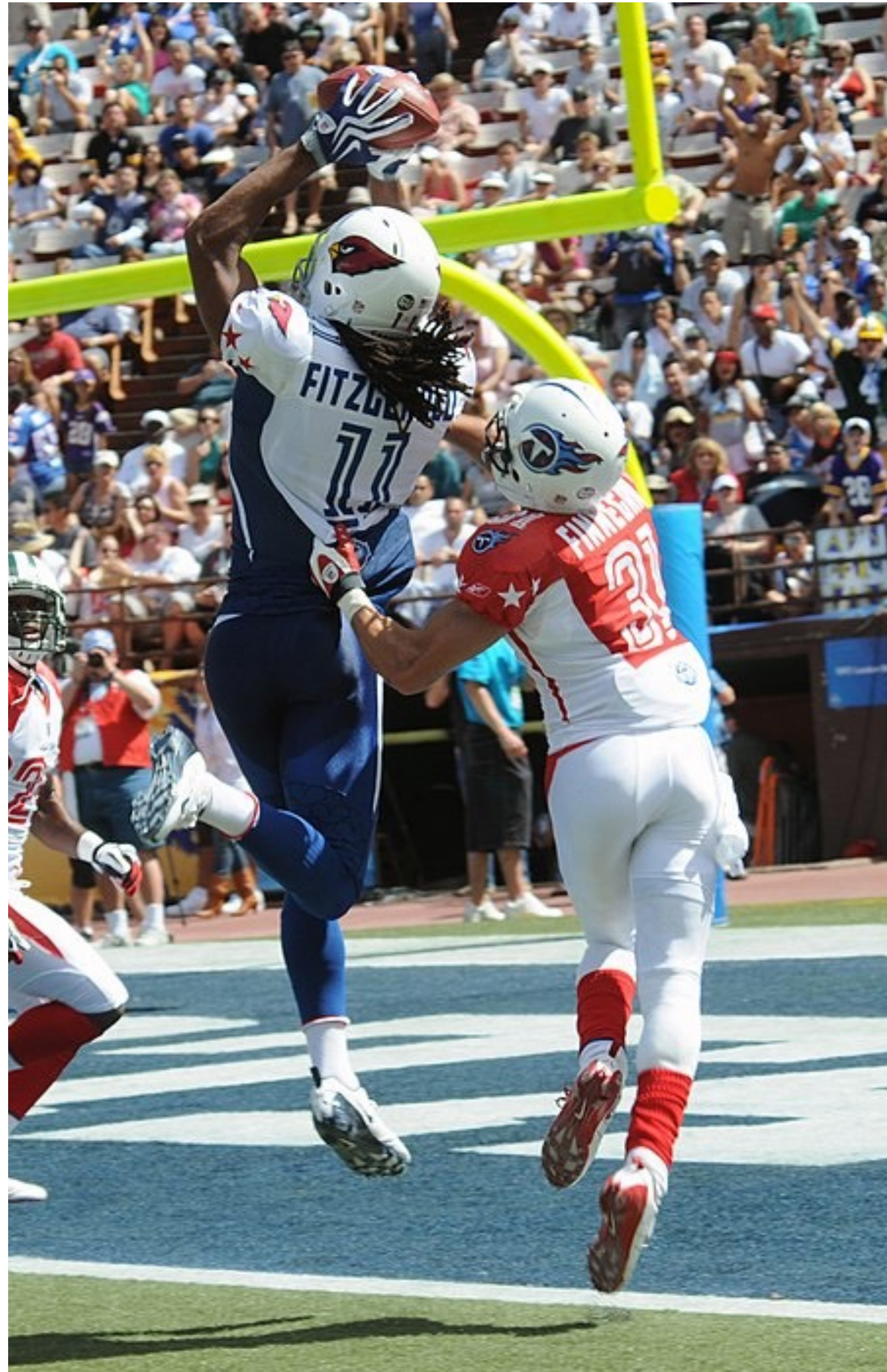
A. American Football