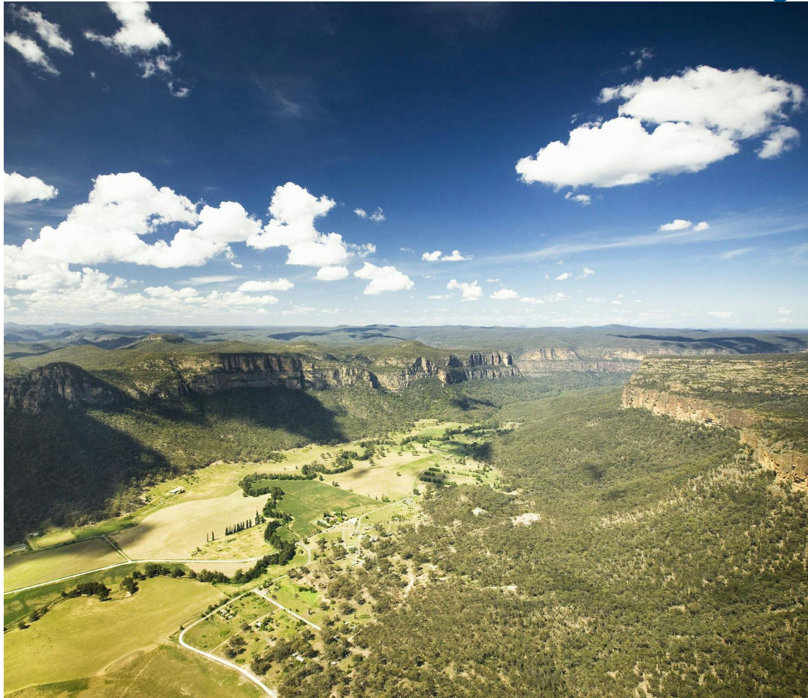
A. Capertee Valley at Lithgow

Question 9. Which is the larger canyon by width?