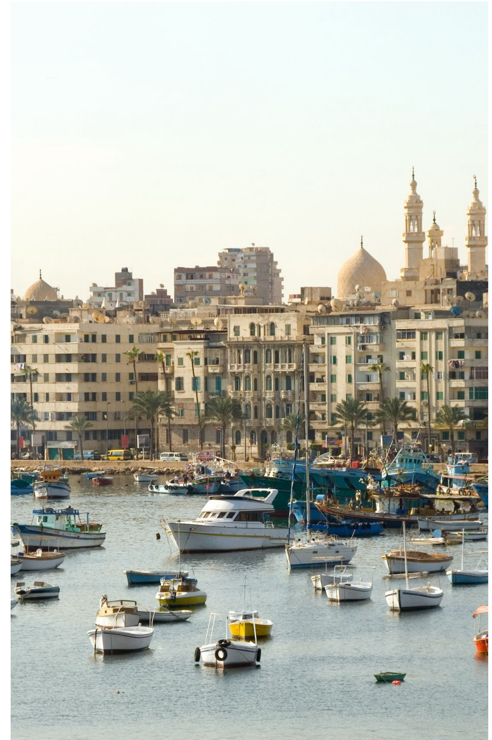
B. Alexandria Egypt