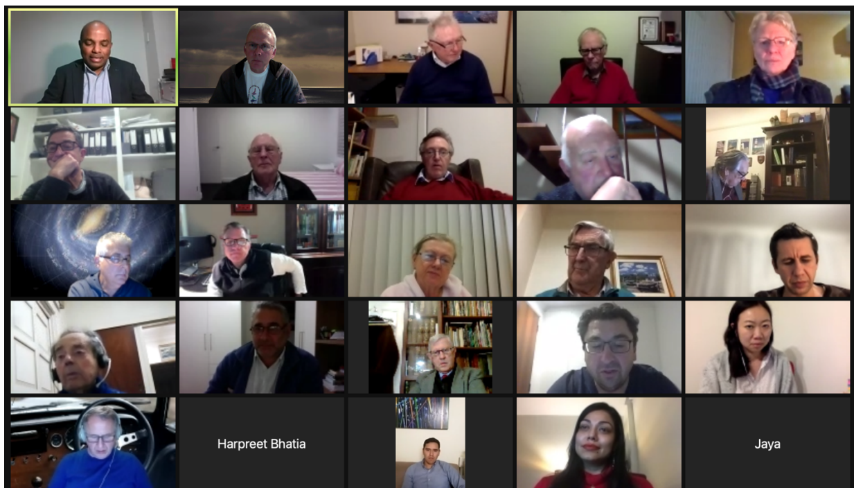
A great roll-up to hear from our two newest members