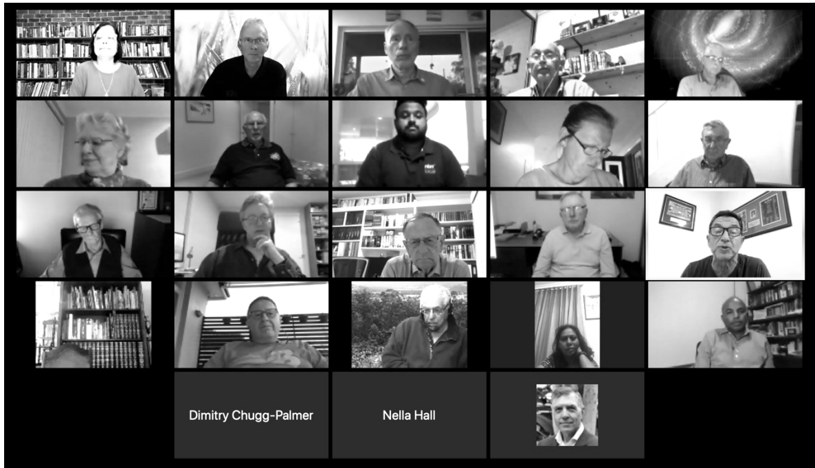
Last week's Zoom meeting (and who is the 'mystery' person third row from the top on the left?)