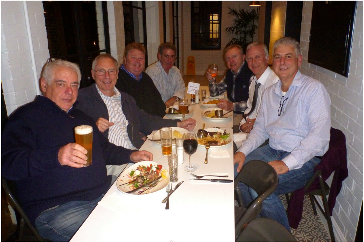
And someone didn't leave empty handed!